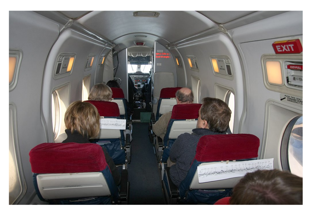
Passenger Cabin - Looking FWD

Disclaimer: All information given in this document is reproduced in good faith as per related information received from the present owner/operator of the equipment. Any equipment described and illustrated here is sold by its present owner/operator "as-is-where-is" unless otherwise stated. Any equipment is offered subject to intermediate sale. Any interested party is requested to contact INAVIA for further equipment details and expression of interest to purchase. INAVIA does not accept any liability in case of inaccurate or wrong information, or if a purchase does not materialise for whatever reason. In particular, any liability of INAVIA in case of economic loss is explicitly excluded.